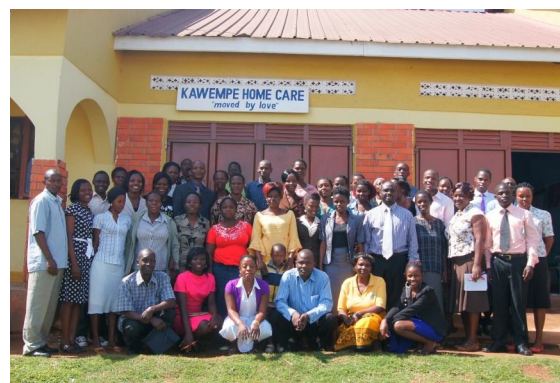
KHC Team 2013

Some of our Partners who have contributed to our success: