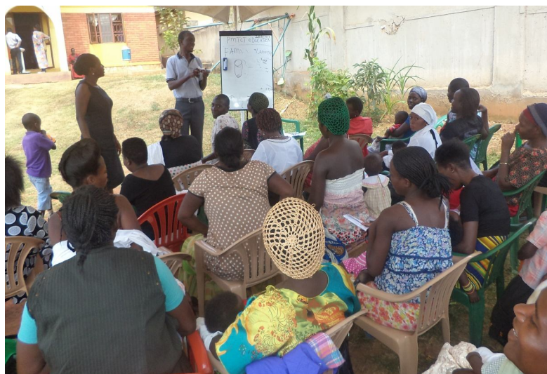
Clinicians train EMTCT mothers on methods to eliminate the further spread of HIV/AIDS.

Today we register a success in this program of EMTCT of HIV/AIDS among HIV positive mothers that are on our care. We are extremely happy to share with you our success for 2013 as 75 new pregnant mothers who were registered on our program all gave birth to HIV negative children. We congratulate our dedicated staff especially the clinicians and the program sponsor who have provided these new babies with a great start to their lives. The mothers are educated in areas such as preventing the transfer of the disease to their child during pregnancy, infant feeding, Adherence counselling, positive living for mothers and children, nutrition for people living with HIV/AIDS, opportunistic infections and so much more. The mothers are also followed up and monitored.